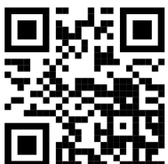
The Senator's vote on the bill!

© Chad Bennion Campaign | * Go to VoteBennion.com to read and learn more about this and other issues.