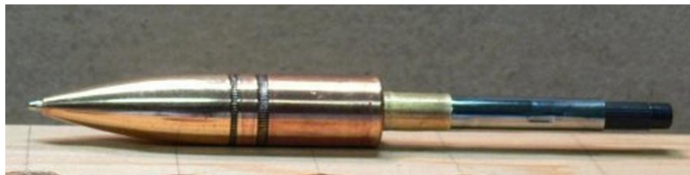
Completed bullet tip for the Cross refill

on the lathe and turn the dowel down to \frac{3}{8} inch diameter so that it is a snug fit in the bullet. If the tube is not centered in the bullet, the bullet will wobble when retracting and extending the refill which will cause it to bind. Press the dowel/tube into the bullet so that \frac{1}{2} inch of the tube extends out beyond the bullet. Drizzle thin CA onto the end of the dowel, but not too much. The CA will soak into the wood and bond to the bullet. If too much is used some will run out the other end and clog the tip. Press in the transmission until the center of the groove is even with the end of the tube (overall length should be 4 inches). Install the refill and continue to 'Making the dowel insert for the Cross refill'.