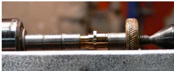
Turning down the flange