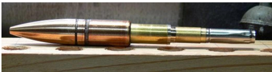
Completed bullet tip assembly for the Parker refill