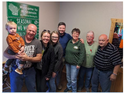
The Steiner and Abler Families together during the visit