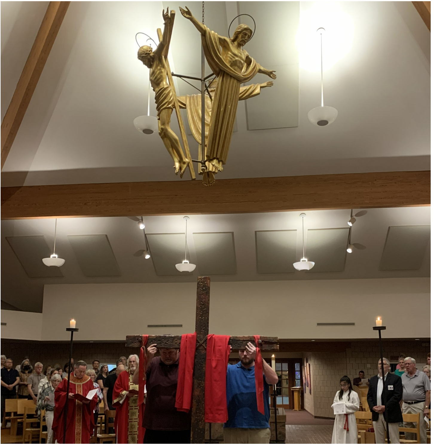
2026 Good Friday service at the Church of the Redeemer