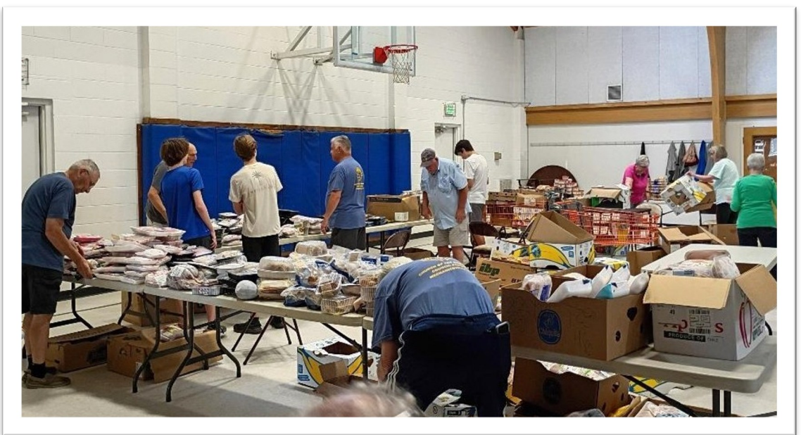
Setting up for the distribution of food, a team effort

Join us and experience the greatest joy in the world: helping those in need, as Christ Jesus taught us.