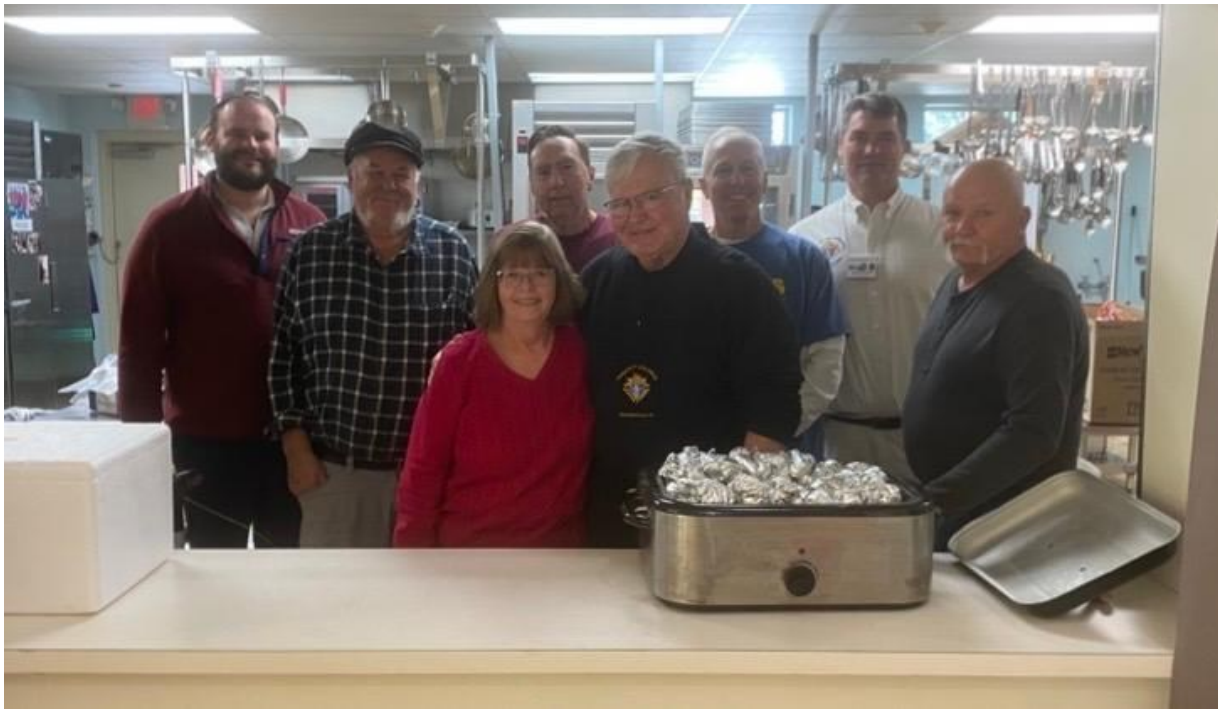
Church of the Redeemer Easter Egg Hunt Hot Dog Team