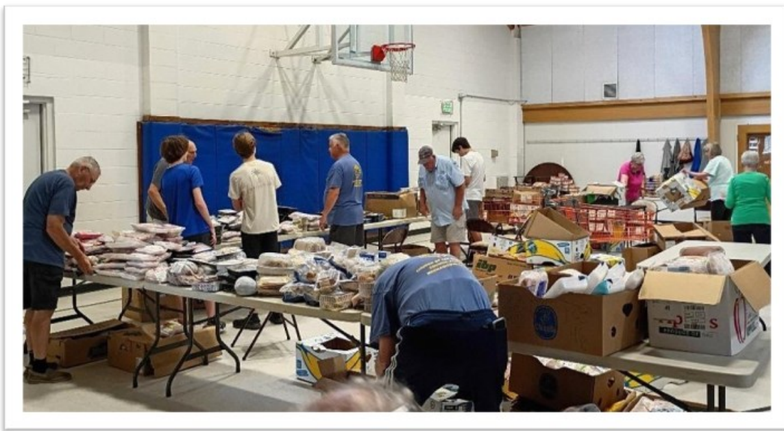
Setting up for the distribution of food, a team effort

Join us and experience the greatest joy in the world: helping those in