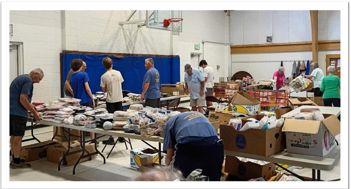
Setting up for the distribution of food, a team effort

Join us and experience the greatest joy in the world: helping those in need, as Christ Jesus taught us.