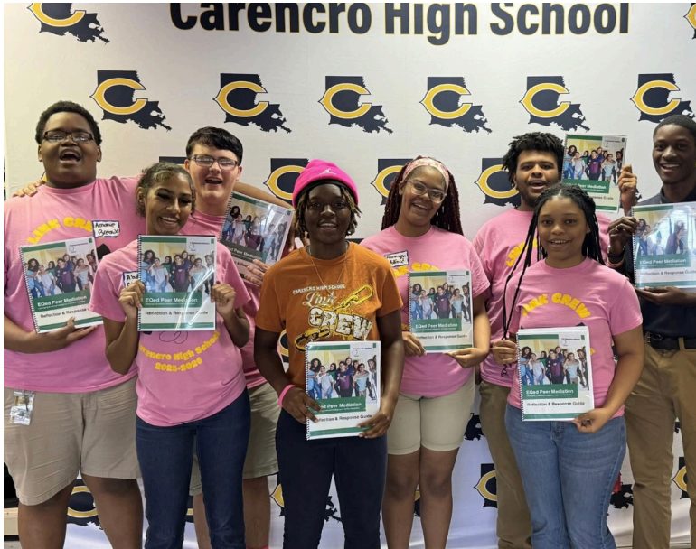
EQed Peer Conflict Mediation Session Carencro High School | Campus Ambassadors

In this 3RD quarter issue of The Quarterly Impact , we highlight a powerful learning experience focused on emotional intelligence, communication, and leadership development. This quarter featured an EQed Peer Conflict Mediation Session delivered to student leaders at Carencro High School, reinforcing the importance of self-awareness, empathy, and responsible decision-making in school communities. Through intentional dialogue and hands-on practice, students were equipped with practical tools to navigate conflict, strengthen peer relationships, and lead with confidence.