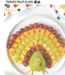
TURKEY FRUIT PLATE