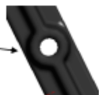
Built-in 1/4" Brass Nut