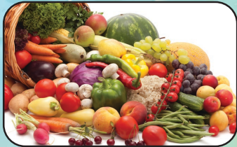
Delicious Fruits & Vegetables