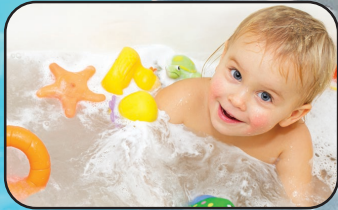
Protect Your Family