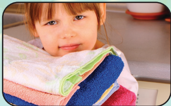
Softer, Brighter Clothing