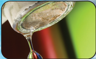
Protect Pipes & Appliances