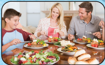
Foods Taste Better