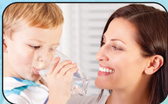
Great Tasting Water