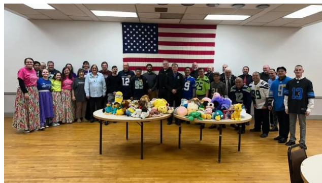
Everyone with all the toys collected