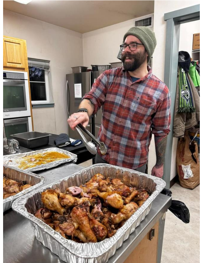
Eat more Chi'kin...