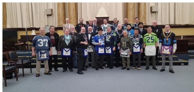
January Stated Meeting Attendees