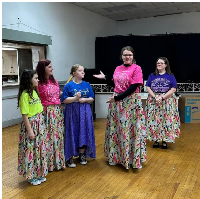
Rainbow Girls Silverdale Assembly No. 155 prepared the evening meal