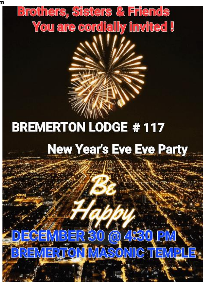
** Do Not Forget to Get Your Tickets **

According to WMC Sec. 14.03 Const: How many days notice must be given to members of the Lodge before voting on a By-Law Change?