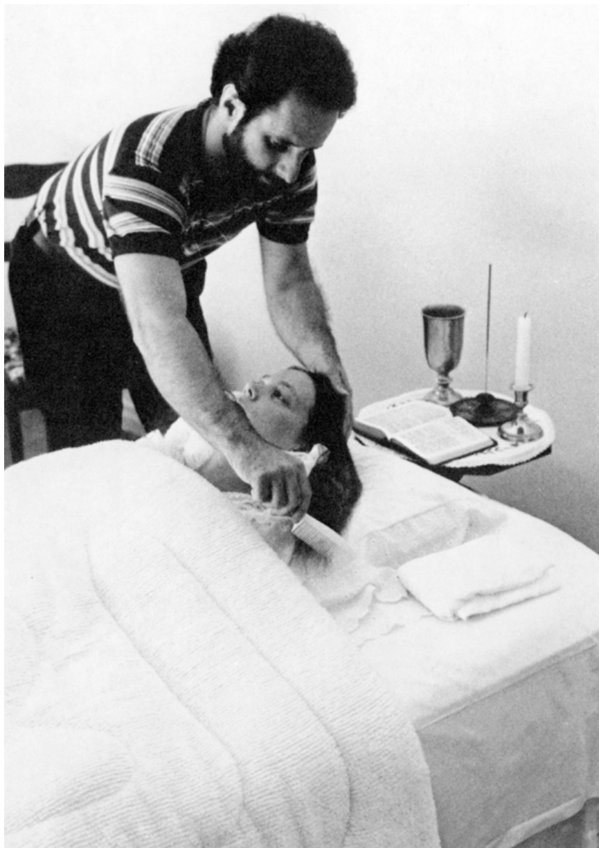
RA, Session No. 69, August 29, 1981: "At this particular working there is some slight interference with the contact due to the hair of the instrument. We may suggest the combing of this antenna-like material into a more orderly configuration prior to the working." ( Photo taken June 9, 1982. )