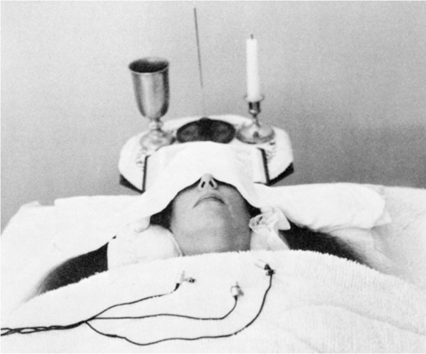
RA, Session No. 2, January 20, 1981: "The instrument would be strengthened by the wearing of a white robe. The instrument shall be covered and prone, the eyes covered." ( Photo taken June 9, 1982. )