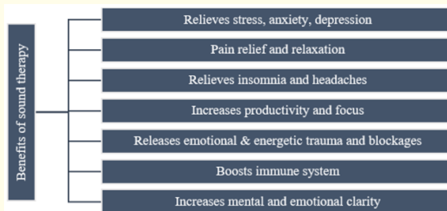
Figure 2: Benefits of sound therapy.

Every physical system in the cosmos vibrates at a unique frequency [1]. The complex human body vibrates in several ways, with each vibrating mode having a particular oscillation frequency. Vibrations are complex, and vary from one second to the next [2]. The sound of the wind, the rustling of leaves, and long undulating grass were all pleasing sensations to early humans [3]. The benefits of sound therapy are listed in Figure 2 (below) [1,4].