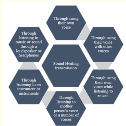
Figure 1: Ways through which sound therapy can be delivered.

Sound therapy is an ancient healing technique. It is the therapeutic use of sound frequencies to transition patients to a state of harmony and well-being. Figure 1 (below) illustrates how sound therapy can be administered [1].