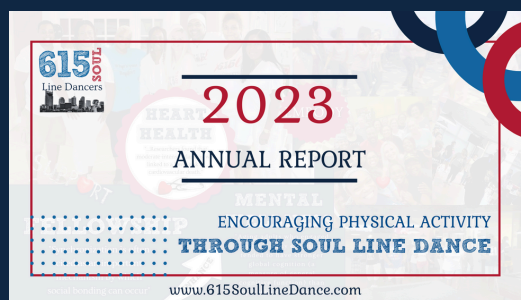
2023 ANNUAL REPORT