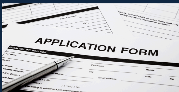
BOARD MEMBER APPLICATION