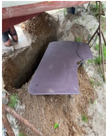
Fig. 1: Board & Trench

Figures 1, 2 and 3 show how we accomplished this.