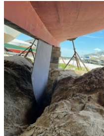
Fig. 2: Board in Trunk