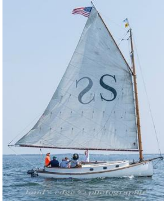
Figure 1: SUSPECT (MARVEL/ELAINE) Racing off Padanaram, Massachusetts, July 2024

Thanks to your continuing support, SUSPECT has been able to enjoy her first uninterrupted sailing season. As this comes to an end, we thought you would enjoy this brief update. A more comprehensive version that includes non-race, adventuresome day cruises with SUSPECT's supporters will follow in the Fall.