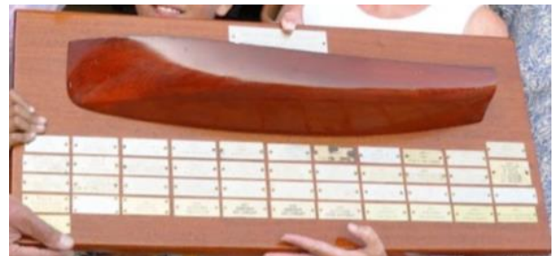
Figure 5 : SUSPECT crossing the finish line and her converted 1 st Place wood boat half-hull award

And in yet another rare, historic catboat race event, SUSPECT also finished last among wooden boats in the Padaarm race (!)