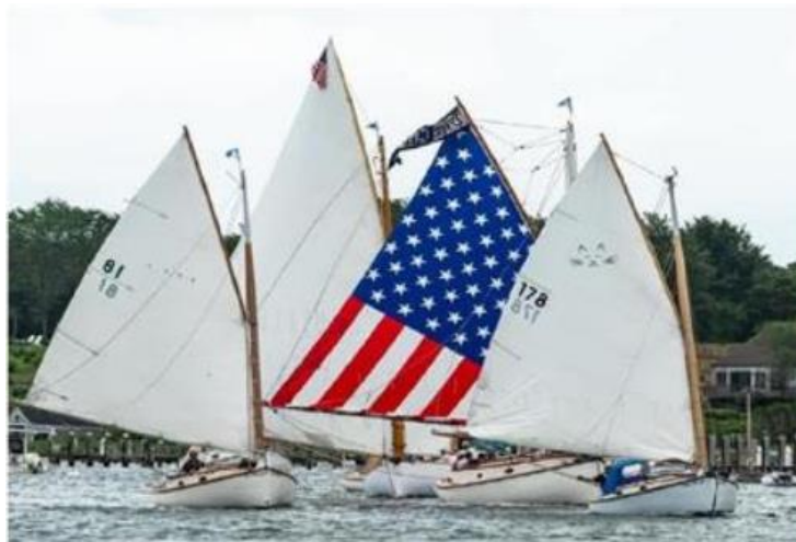
Figure 3: A portion of the Edgartown Catboat Parade of Sail (TIGRESS flying the Stars and Stripes)

The race itself started off under excellent sailing conditions. Unfortunately, as it progressed the wind and sea state increased to small craft advisory conditions. As a result, only a few of the more modern catboats were able to finish and SUSPECT had to return to the harbor and accept a DNF (Did Not Finish) tag. Disappointing as this was, the Edgartown race was the first that SUSPECT participated in in over 30 years and constituted a significant milestone for the Old Girl.