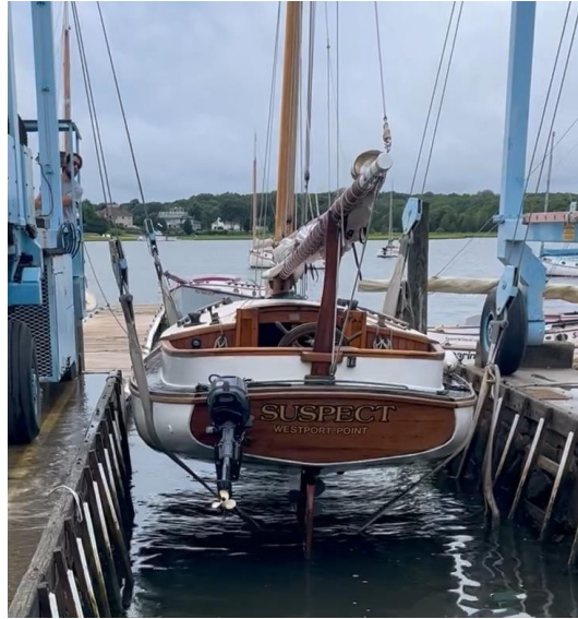
Figure 4: SUSPECT's open seams recaulking required a haul-out at the Marshall Marine yard.