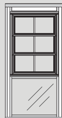
Glass Kick Plate