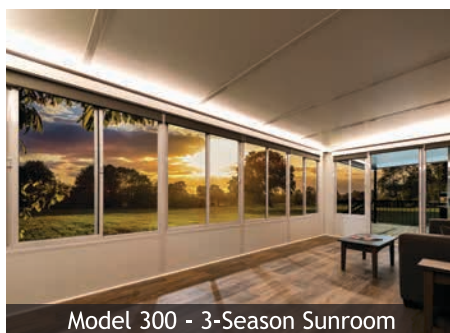
Model 300 - 3-Season Sunroom