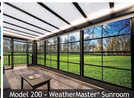
Model 200 - WeatherMaster® Sunroom