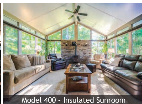
Model 400 - Insulated Sunroom