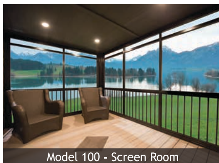
Model 100 - Screen Room

A hidden lighting system that is embedded into valance to provide indirect lighting. Based on the same light that comes from the sun, but with the ability to add a dimmer for ultimate control of your light. Whether soft light to read by, or entertaining with your guests, Sunlight by Sunspace is the perfect source!