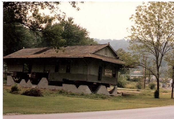
DEPOT BEING MOVED