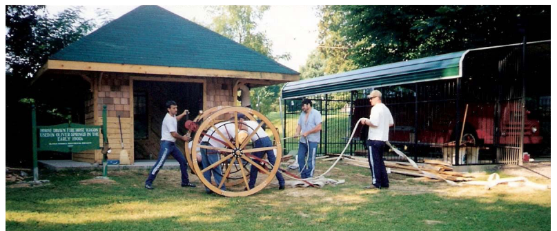
WORK BEING DONE ON FIRE ENGINE DISPLAY IN DEPOT PARK