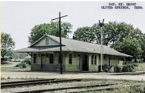
DEPOT CIRCA 1970

The museum's presence in the depot helps preserve and showcase the community's history in its authentic setting. The depot also has a historical significance and connection to local heritage. Maintaining the museum in the depot is an important part of local history, making it a fitting location for exhibits about the community's past especially when displayed in its original historic structure. In addition, historic depots can attract visitors, which can support local businesses and contribute to local economic activity.