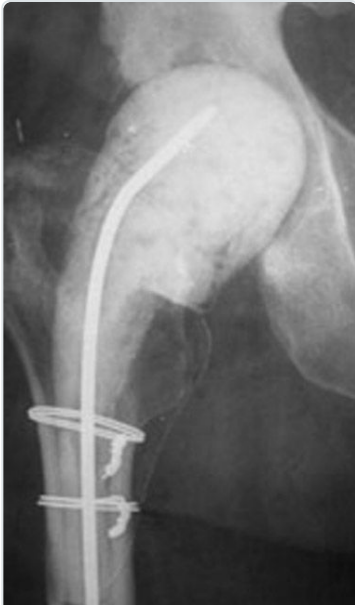
An antibiotic spacer in a hip joint.

Patients who undergo staged surgery typically need at least 6 weeks of IV antibiotics, or possibly more, before a new joint replacement can be implanted. Orthopaedic surgeons work closely with other doctors who specialize in infectious disease. These infectious disease doctors help determine which antibiotic(s) you will be on, whether they will be intravenous (IV) or oral, and the duration of therapy. They will also obtain periodic blood work to evaluate the effectiveness of the antibiotic treatment.