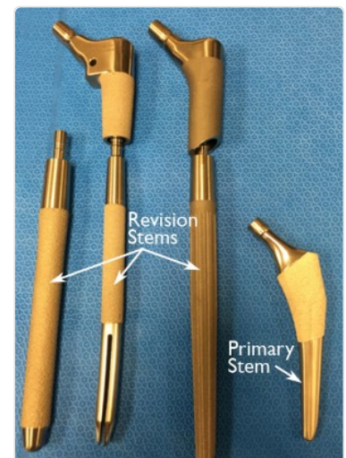
Implant stems used in revision surgery next to a stem used in primary hip replacement. Revision stems are often longer to make up for lost bone in the femur.

Occasionally, a controlled "fracture" of the femur (thighbone) will be performed in order to remove a well-fixed stem. The femur will be put back together once the new stem is in place.