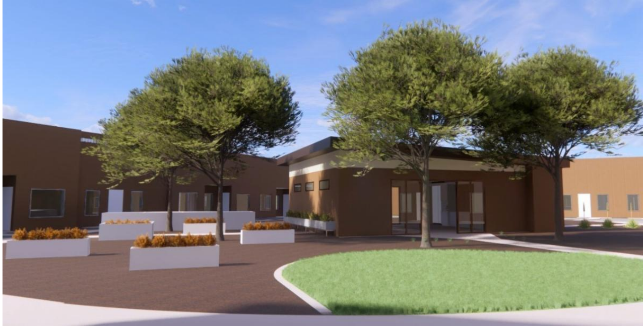
Pictured above: Architectural rendering, Outdoor Education Pavilion (FFKR Architects).

We have broken ground on our Outdoor Education Pavilion! Estrella Center residents eagerly await its' early 2025 completion. When finished, it will be used to even further expand our dedication to resident-enrichment with gardening and aroma therapy, nutrition and cooking, exercise and physical therapy.