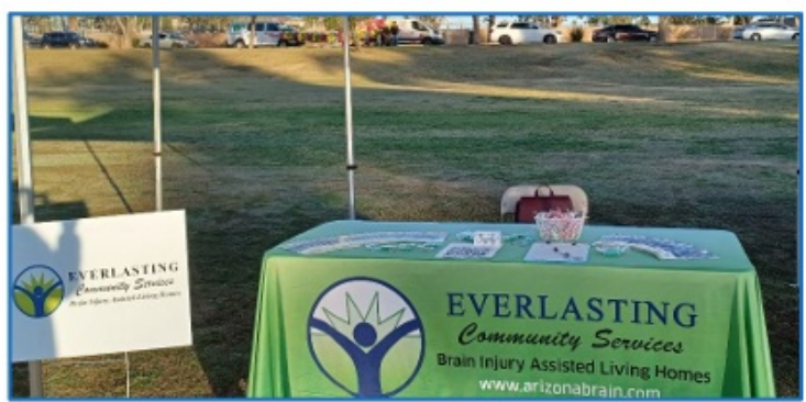
Pictured: Top left, the American Case Management Association Conference in Scottsdale March 8 th . Top right, The Brain Injury Association of Arizona Run, Walk and Roll in Tempe on March 22 nd . Bottom left, AT Still University Health Expo in Mesa on March 29 th . Bottom right, the 21 st Annual American Indian Disability Summit in Phoenix on April 11 th .