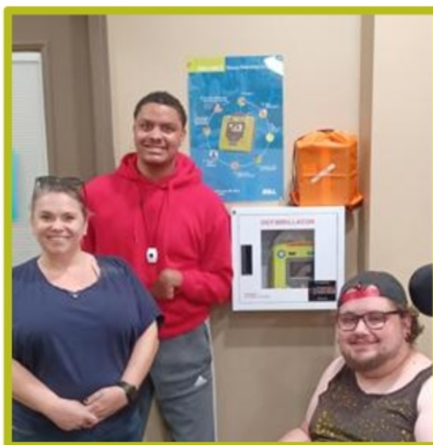
Pictured: Resident representatives of Everlasting Services pose with our new AED, Life Vac and First Aid Kit.