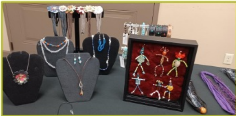
Top left: Jewelry made by Everlasting residents.