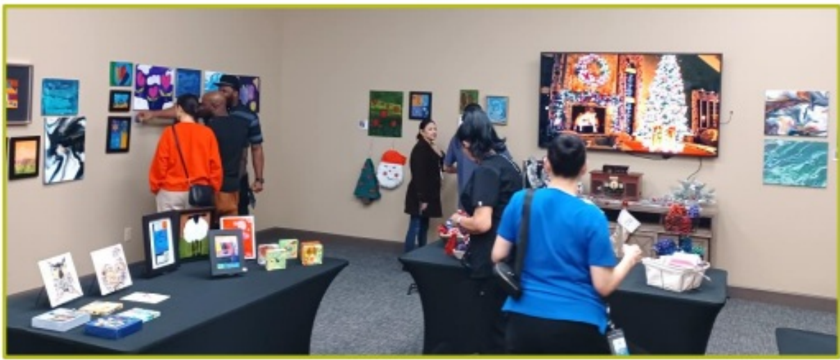
Pictured above: visitors mingle with artists and look at featured art.