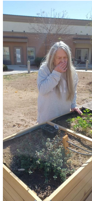
Pictured: Above, Art Therapy. Middle, "Planting the Seeds." Far right, herbs for aromatherapy.