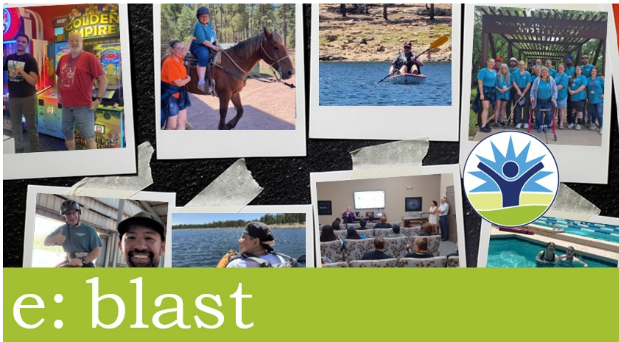
Header photos from August 7-10th Camp Brain in Payson, Arizona