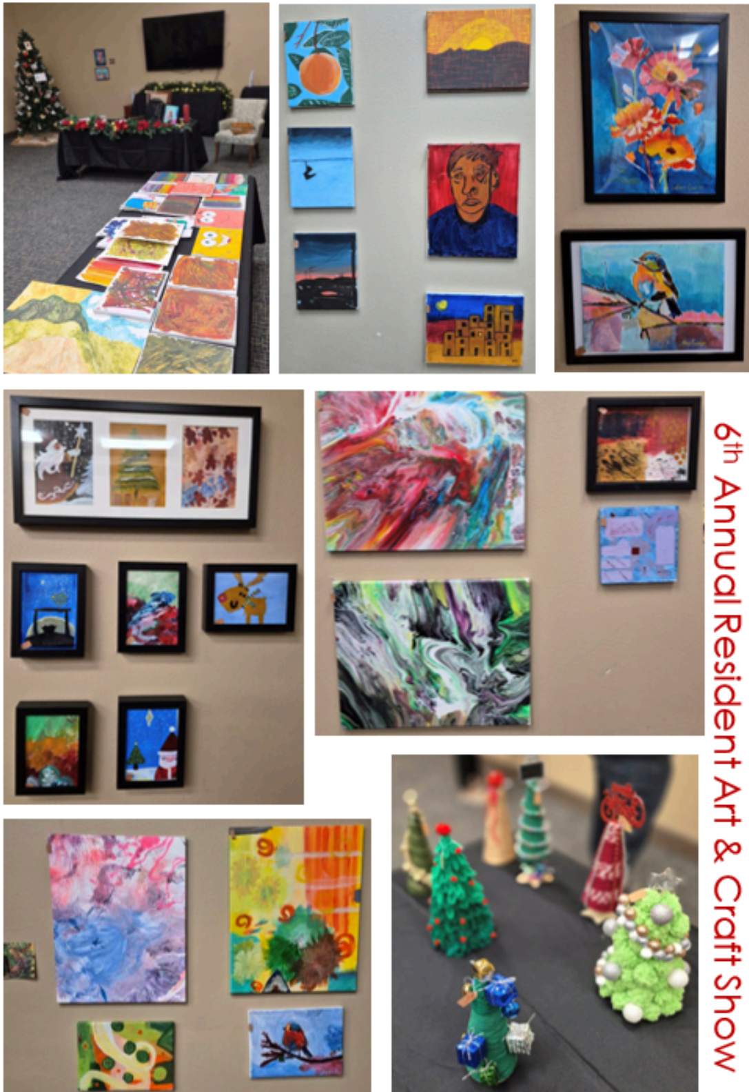
6th Annual Resident Art & Craft Show

On December 2nd, residents, staff and visitors enjoyed Everlasting's 6th Annual Art and Craft Show. Talented residents sold their work, while shoppers delighted in refreshments and mingling with the artists. If you missed the event this year, not to worry - we still have holiday cards for sale featuring resident art (see below) and there is always next year! Watch for your invite in 2026!