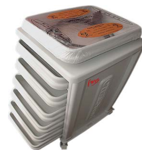
IMS Flexible Endoscope Transport and Staging