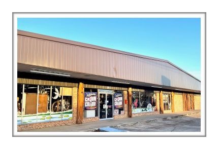
6. Louisiana Cajun Culture 515 N. Pine Street 9 a.m. to 7 p.m. Mon.-Sa