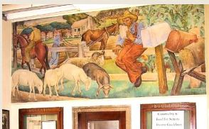
"Rural Free Delivery"