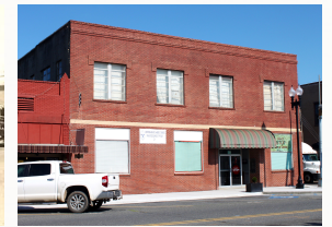
The old bank building today.