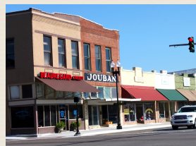
The building today.