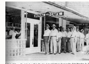
An early 1950s scene at the Royal Cafe.