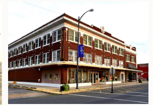
The Standard Building is now the Treasure City Mall.