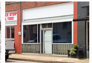
The building today.