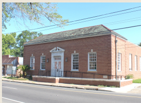
The building today.