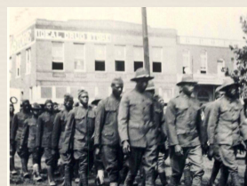
WWI soldiers marching in front of the building.

(103 N. Washington St.) This building housed Ideal Drugs for years, yet before that, it was the People's Supply, an early mercantile. The Jouban family operated their store in the building starting in 1923 and in various forms, it was a mainstay for decades.