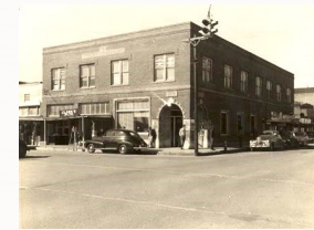
The building was originally a drugstore.

( 101-103 S. Washington Street ) This building was built around 1915 and early on, housed a drugstore. In 1928, it became the first location of City Savings Bank. The building now houses Dance Stop which has a long history in DeRidder. Dance Stop has been teaching dance to local children for 35 years. The building is owned by the City of DeRidder and is currently being rehabilitated.