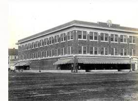
The building was originally the Long-Bell Commissary.

( 121 S. Washington Street ) In 1904, the Long-Bell Lumber Company of Kansas City, Missouri, established a large mill within sight of the central business district. It became the town's largest employer. The Hudson River Lumber Company was a subsidiary of Long-Bell. The company built a wood-frame commissary first, yet around 1917, it was replaced by a brick building.