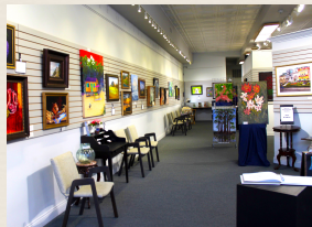
"RealArt" DeRidder takes its name from an old DeRidder movie theater.

The RealArt DeRidder Gallery building is owned by the city, but it is a collaboration of the community. Volunteers staff this wonderful, little gallery which features the works of local and regional artists.