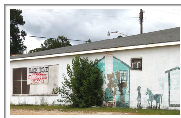
3. Back Home Collection 902 East 1st Street 9 a.m. to 5 p.m. Mon.-Sat. 337-462-4629