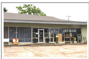
1. Big Stick Long Bow 1145 East 1st Street 10 a.m. to 5 p.m. Tues.-Sat. 337-462-3764