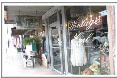
5. Vintage Girl 111 W. 1st Street 10 a.m. to 5 p.m. Thurs.-Fri. 10 a.m. to 4 p.m. Sat. 337-460-1374