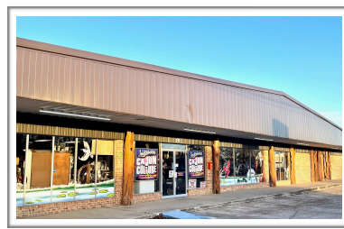
6. Cajun Culture 515 N. Pine Street 9 a.m. to 7 p.m. Mon.-Sat. 225-937-8872