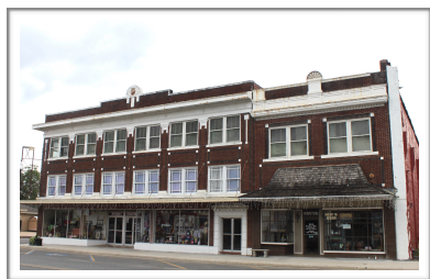
4. Treasure City Market 121 S. Washington 10 a.m. to 5 p.m. Tues.-Sat. 337-460-6004