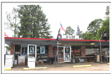
2. G&M Army Surplus and Flea 1034 East 1st Street 8 a.m. to 5 p.m. Mon.-Fri. 9 a.m. to 3 p.m. Sat. 337-463-4224