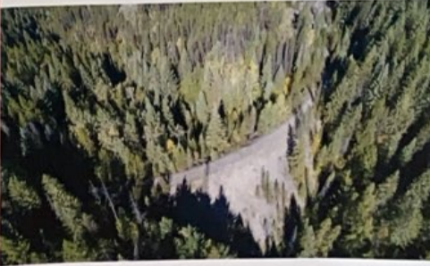
Porcupine Creek with the trestle filled in.