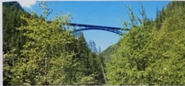
Unique view of Paulson Bridge

Trails of the Paulson is a project initiated by Grand Forks ATV and West Kootenay Sno Goers in 2020 to enhance outdoor recreational activities in the Paulson Area. This covers from Christina Lake to Castlegar and the mountain ranges adjacent to highway 3 in Southern British Columbia.