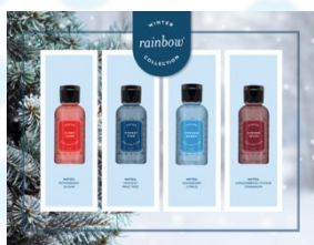
WINTER FRAGRANCE PACK $35 Value