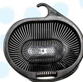
STRAINER $20 Value