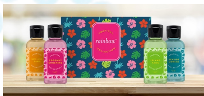
TROPICAL FRAGRANCE PACK $35 Value