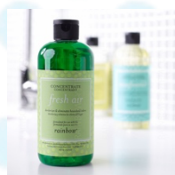
FRESH AIR $30 Value