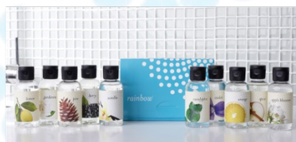
ORIGINAL FRAGRANCE PACK $30 Value

Rainbow $ has NO CASH VALUE and are ONLY redeemable for Rainbow Products as listed, after your program is completed and verified!!!