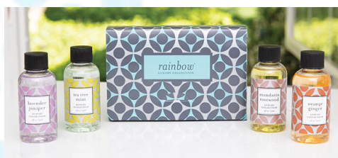
LUXURY FRAGRANCE PACK $35 Value