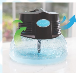
RAINMATE $150 Value