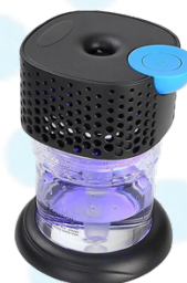
AIRCARE TO GO $75 Value