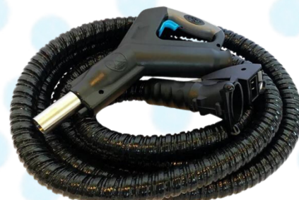
14' EXTENDED HOSE $200 Value