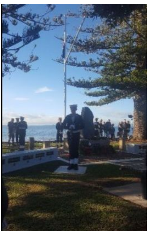
Timetable of Events ANZAC Day 2021