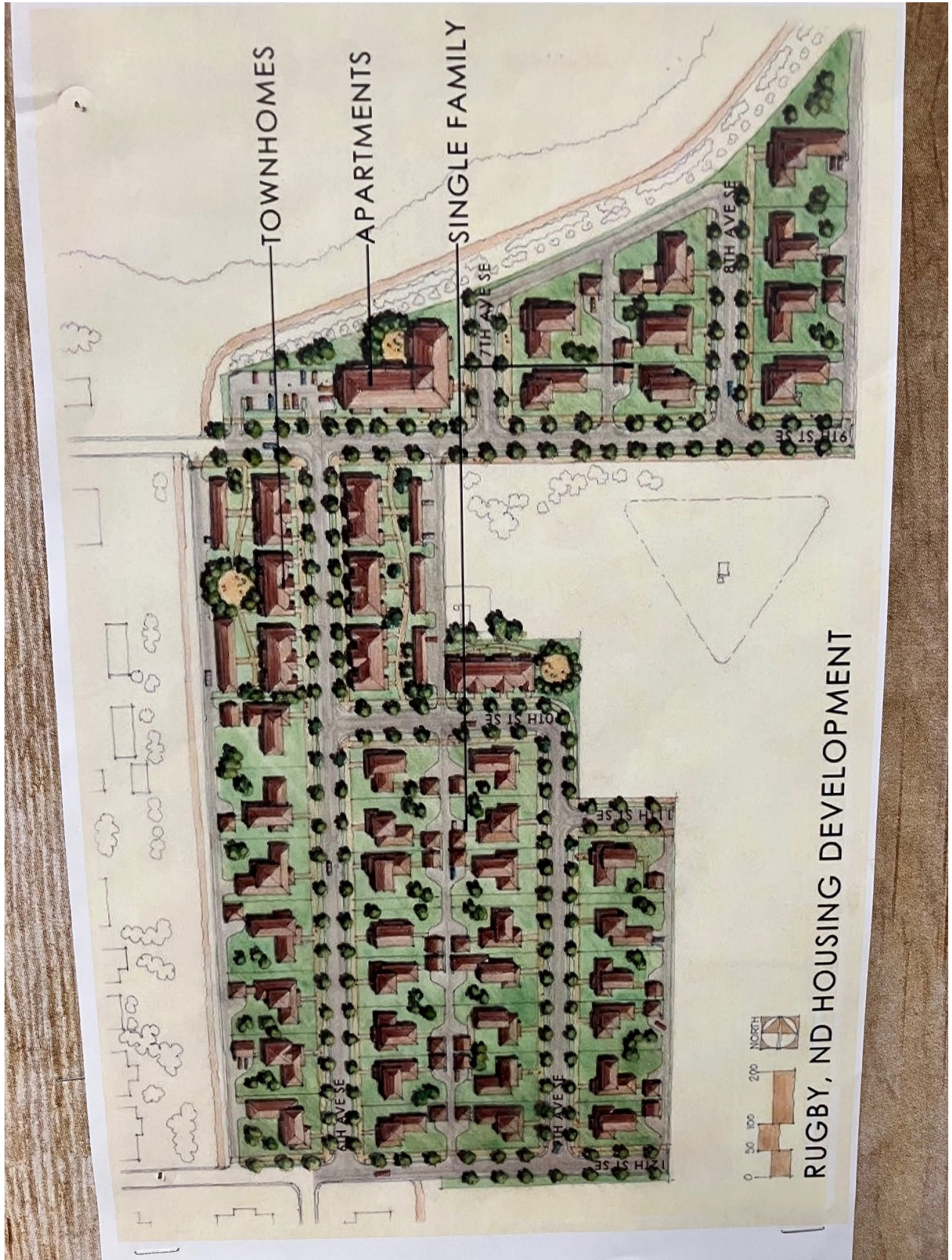
FIGURE 2: DEVELOPMENT CONCEPT MAP