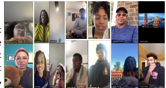
OG ZOOM Lunch and Learn

After a few months, we realized that calls or texts alone was not enough, so we implemented monthly lunch and learns where we would meet our students at school during lunch– provide lunch, get and give updates and encouragement. We also emailed teachers, met with students and parents face-to-face outside of school, reviewed progress reports, assisted with scholarship applications, wrote recommendation letters, etc. They were also given assignments to include preparing a scholar profile and creating a parchment account to send us their official transcripts. Students earned surprise $5 cash app rewards for completing assignments, etc. At times, we got a little firm with them to get them on track. Additionally, we encouraged them to attend ZH sponsored events such as our scholarship and law and you workshops. In February, we had a fun outing at Dave & Busters with students, parents and mentors. We enjoyed the time to further bond, share, eat and play games.