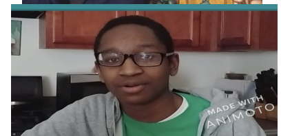
My Children & Their Love Languages