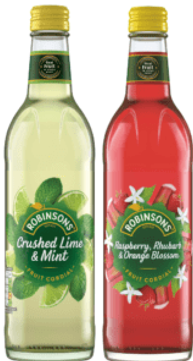
Crushed Lime & Mint, Pear & Elderflower & Raspberry, Rhubarb & Orange