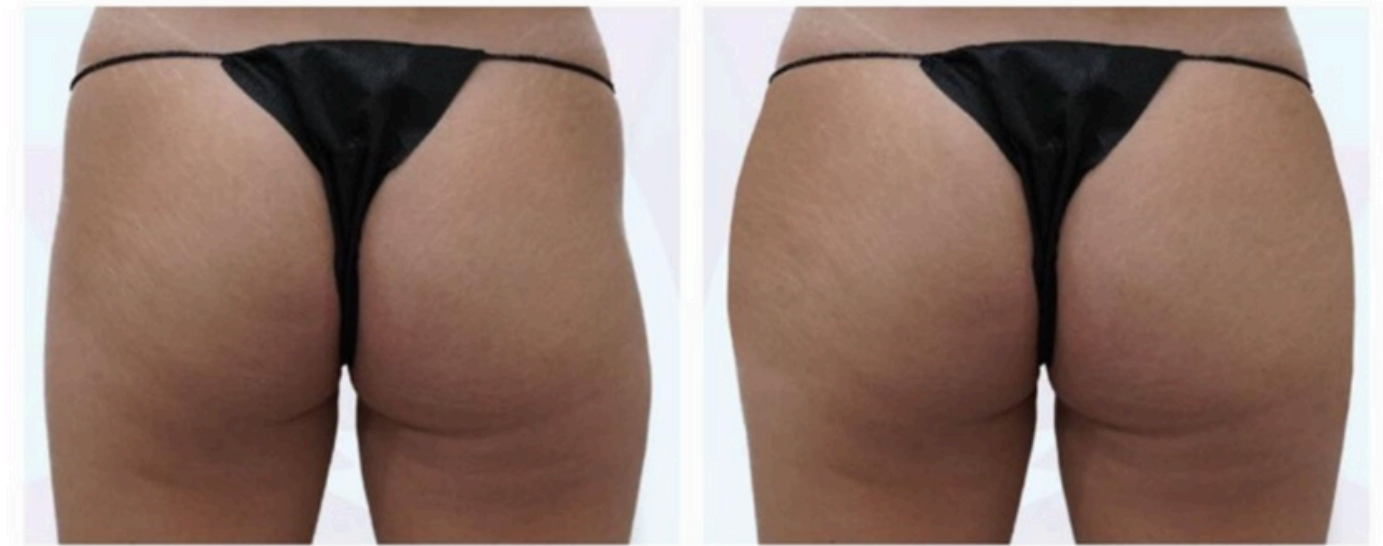
After 2 Sessions at 1 month interval 6 vial per session

School Demo : Non-Surgical Breast and BBL enhancements