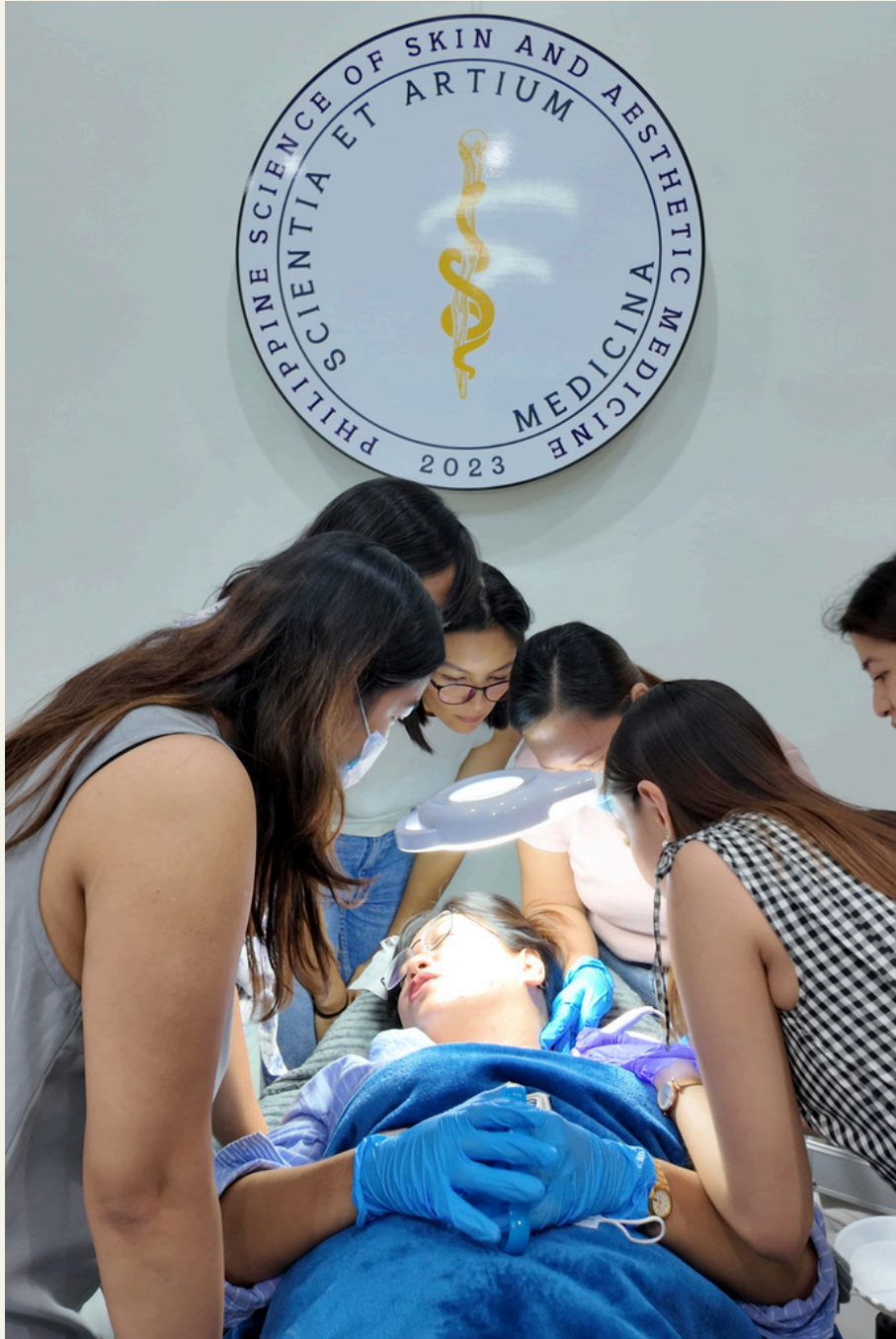
Return Demonstration: “Vampire Facial”