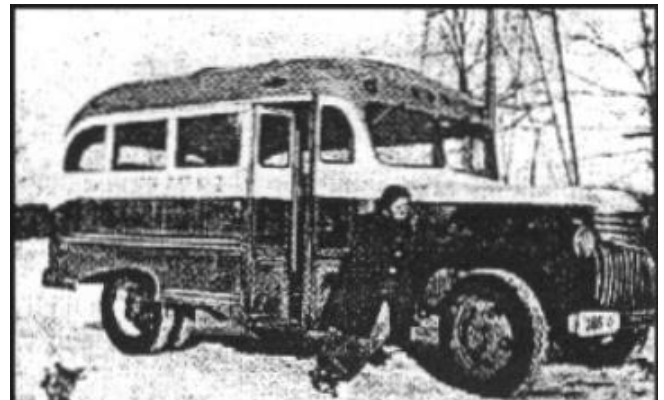
Town's first School Bus!

The Town of Foster, Clark County is the largest Township of Clark County, consisting of 72 sq. miles of which approximately 42,500 acres are County Forest Lands.