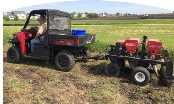
4 ft Kasco No-till Drill

This seeder is great for projects > 5 acres. Used for both native and cool season grass plantings, this seeder is equipped with three seed boxes, wavy cultures, and a roller allowing for light ground disturbance and good seed to soil contact. Excellent for seeding grassed waterways and small interseeding projects.