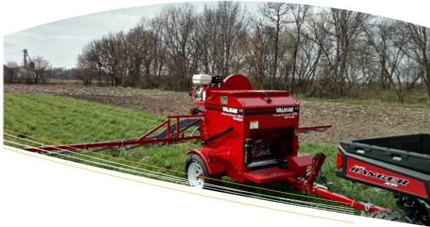
20 ft Valmar Broadcast Air Seeder

This seeder is great for projects big and small. The District has used this seeder on projects up to 100 acres and as small as half an acre.