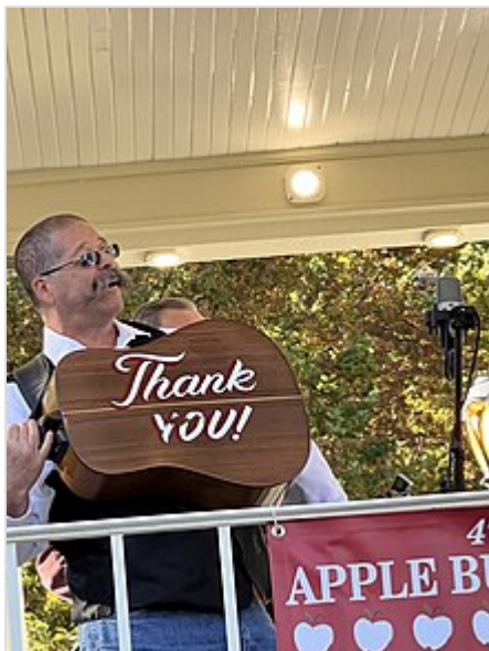
2022 - Typical ending for High Octane at the Apple Butter Festival, Berkeley Springs, Berkeley Springs, WA

Access to the music: https://www.reverbNation.com/marvashbyhighoctane