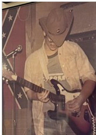
Desperado - 1977