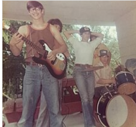
Mainline - 1975