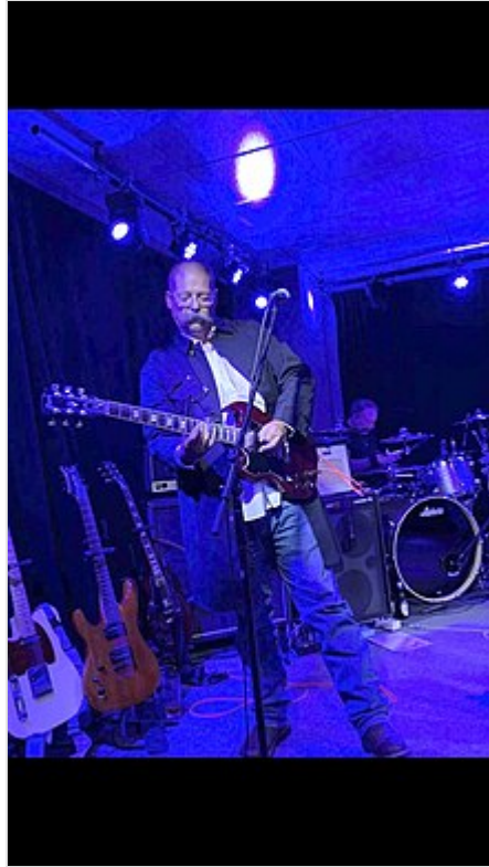
2019 - Hometown Blues CD release party at the Backstreet Bar & Grill in Winchester, VA