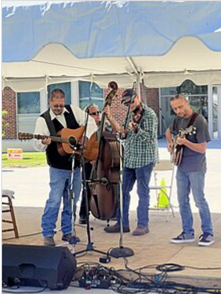
2023 - High Octane at the Appalachian Festival, Frostburg State University, Frostburg, MD