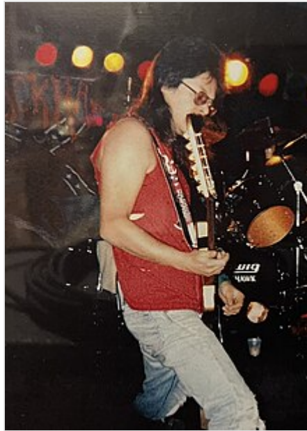
Blackhawk - 1992