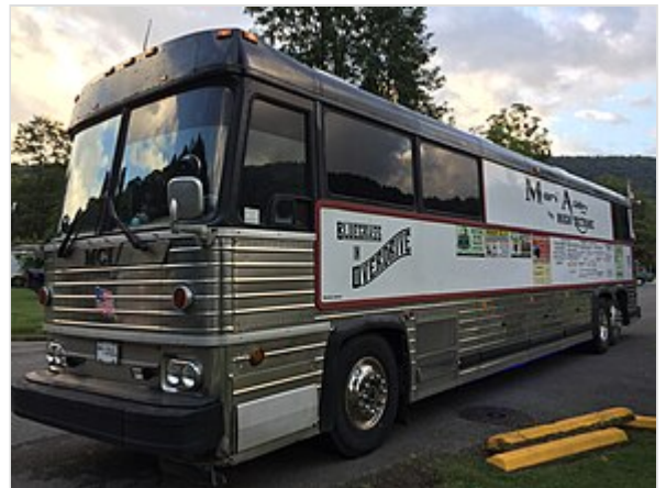
2019 - The Tour Bus in Rowlesburg, WVA