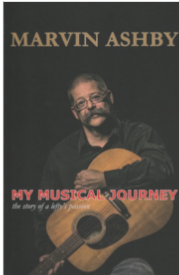
The Book - 2023