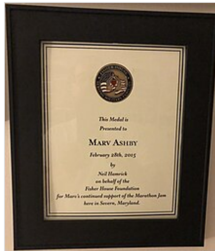
2015 - Fisher House award