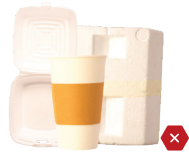
NO Foam Cups & Containers