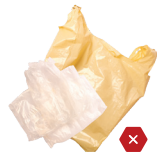
NO Loose Plastic Bags, Bagged Recyclables or Film Empty recyclables directly into your cart