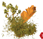
NO Green Waste