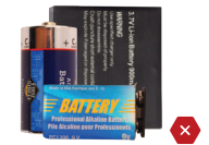
NO Batteries Check local drop-off programs for proper disposal