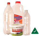
Plastic Bottles, Jugs, Jars & Tubs