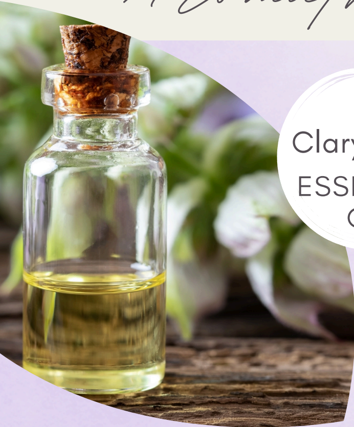
Clary Sage ESSENTIAL OIL