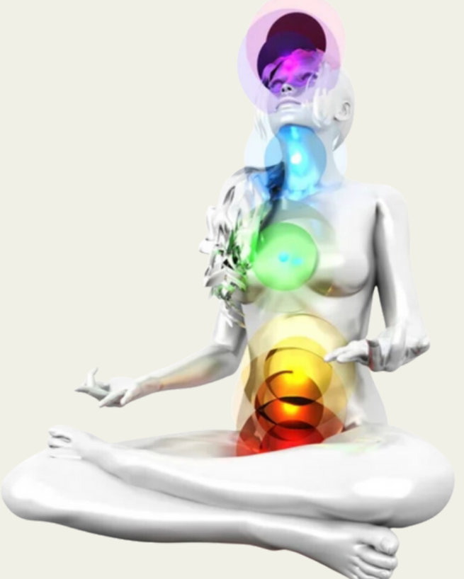
Soul Star Chakra