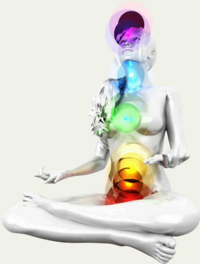
Earth Star Chakra