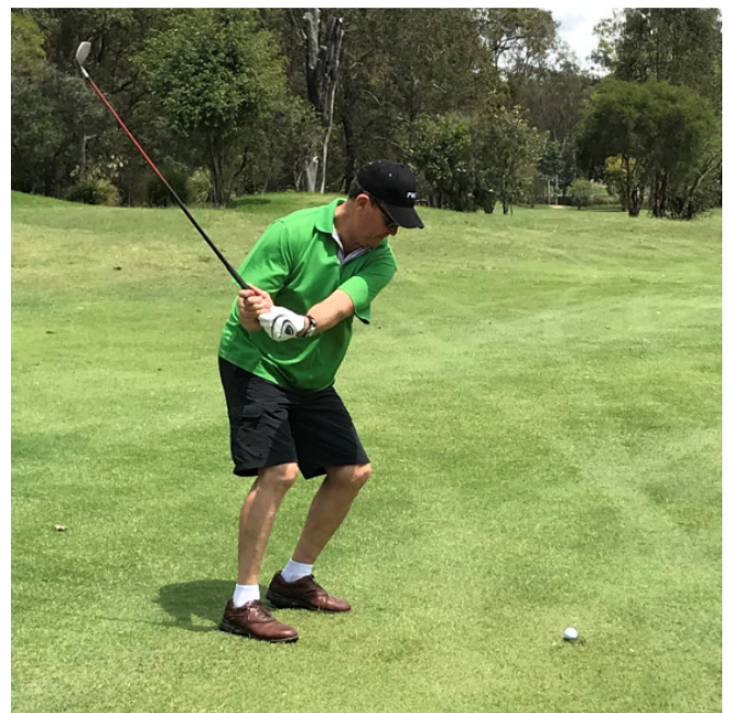
A PWI member demonstrating nice form