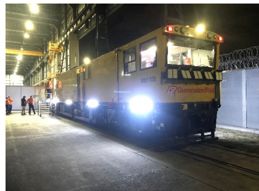
QR MMNY038 track recording machine at Banyo

If you have an interest in presenting at a technical event, please contact the PWI Qld.