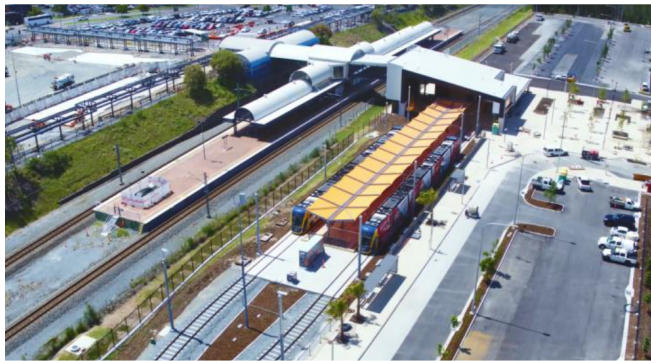
Helensvale Intermodal Station

At the end of the event, a BBQ and drinks session were held.