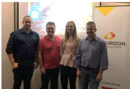
PWI event at Rockhampton in February