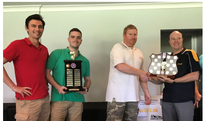
ARTC Team - Winners are grinners