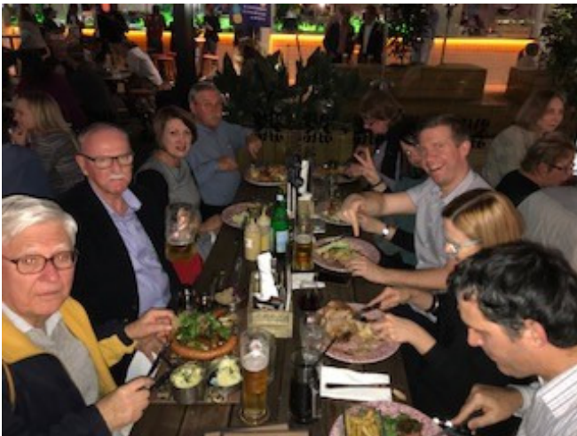
Partner's night at Bavarian Beerhaus