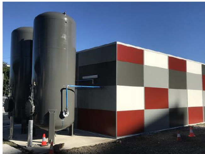
Pneumatic compressor room in Brisbane

plan to implement a rollout of pneumatic operations to cover all points motors within the inner-city network. This is aimed to cover more than 200 motors spread between Milton and Bowen Hills.