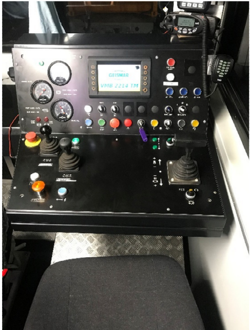
QR MMNY038 driving seat

Adam provided an overview of the project and some of the challenges faced during its construction from a rail perspective.