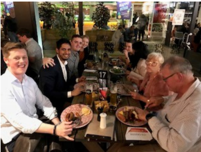
Partner's night at Bavarian Beerhaus