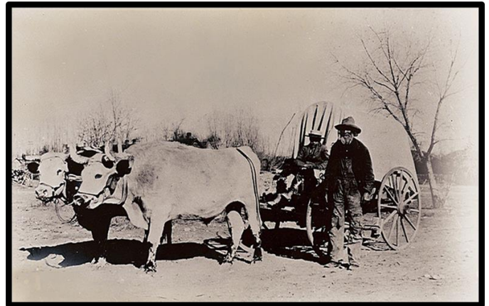
The picture you see here is like what he might have drove across the countrv.