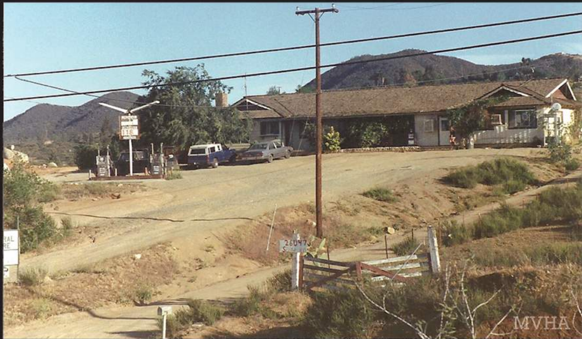
Photo date: late 1970's Engleson's Market (now Menifee Market) located on Scott Road at Murrieta Road. The small store served the area providing gas, basic grocery items and supplies.