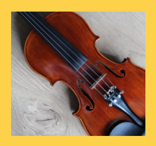
Fiddle Group Tuesday 12 Sept 2pm - 3.30pm Bring your fiddle along to this friendly group, whether you are a beginner or more experienced, you're welcome. £1.50 per person