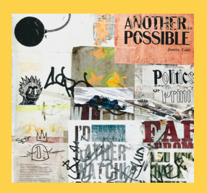
Machars Arts & Craft Group Wednesday 13 Sept